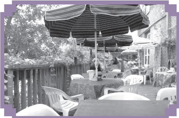
River Rose Cafe #51 on map

LIGHT YOUR WAY TO CHRISTMAS - First Friday in December, 5-8 pm, Downtown Owego streets comes alive with luminary lights and holiday decorations! Music and entertainment throughout the downtown area. Feel the real old-fashioned spirit of Christmas as stores and restaurants offer special gifts and music to delight the shoppers.