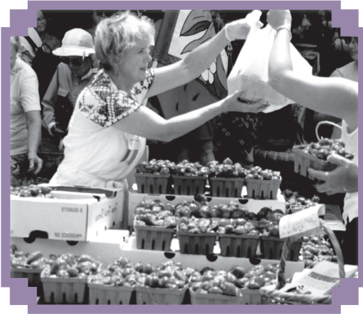
Enjoy plenty of strawberries 3rd Saturday in June at the Annual Strawberry Festival