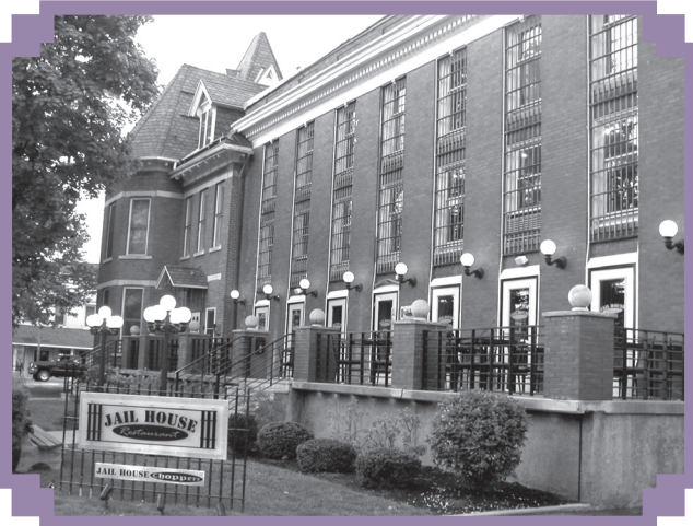
The Jail House Restaurant, Court & Main Street, #52 on map