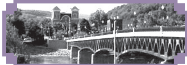
Court Street Bridge entering Downtown Owego