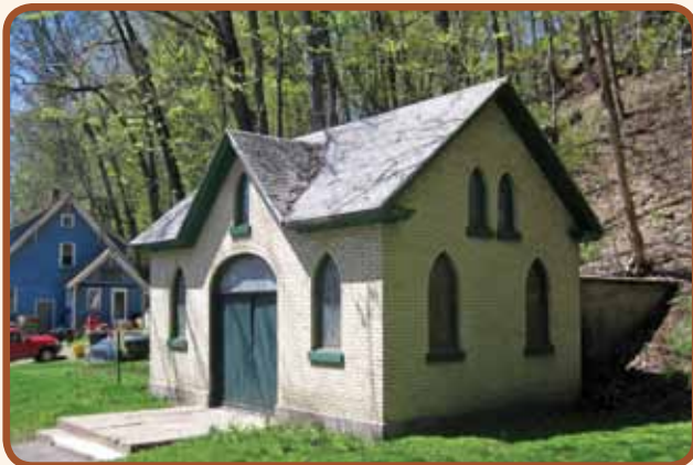
Owego Mortuary Chapel

small stone markers. Most have metal pegs with a number stamped into the top of them, but they are pushed into the ground and cannot be seen unless one looks for them. There is also a section (12) referred to as the “Firemen’s” section, and what used to be the “Mason’s” section (15), but the Mason’s section has been donated to the village. Since 1851 the cemetery has more than quadrupled in size, growing from eleven and one-fifth acres to 51.2 and is divided into twenty-two sections.