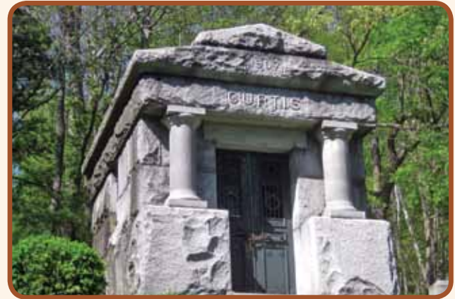
Curtis Mausoleum 1907