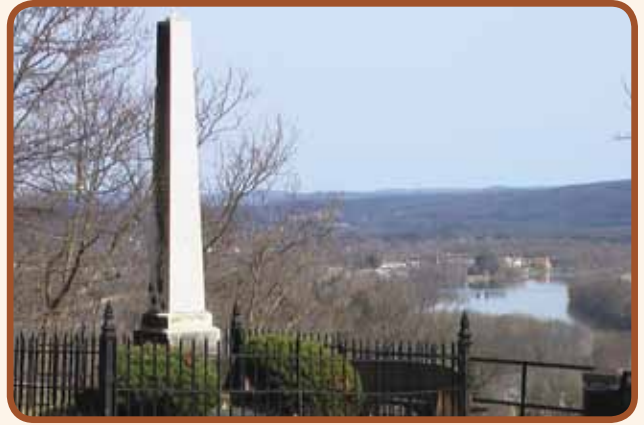
SaSaNa Loft Monument

Included in the cemetery is a section for the Civil War burials. The boundary line of that section is accentuated with four cannons, creating an impressive appearance. There is also a Potter's Field located at its lowest point. Although there are many burials in it, there are only a few