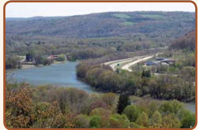
East view from the summit