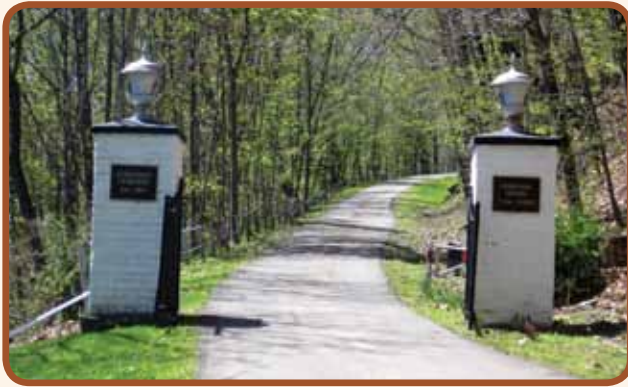
Entrance to the cemetery