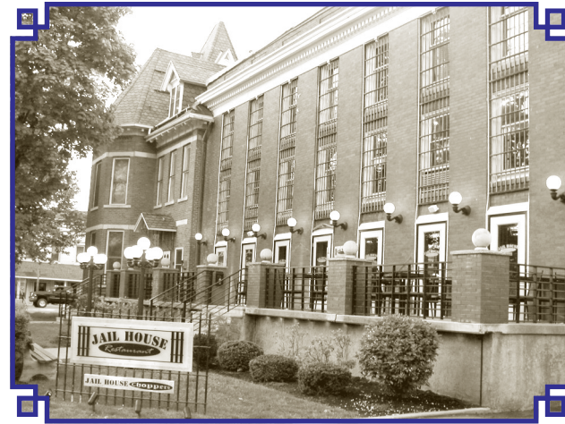
The Jail House Restaurant, Court & Main Street, #55 on map