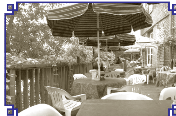
River Rose Cafe #54 on map

Enjoy plenty of strawberries 3rd Saturday in June at the Annual Strawberry Festival