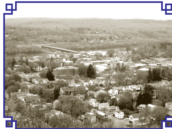
Hilltop View of Owego, NY