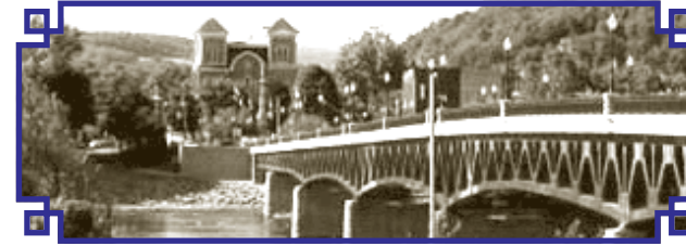
Court Street Bridge entering Downtown Owego

LIGHT YOUR WAY TO CHRISTMAS - First Friday in December, 5-8 pm, Downtown Owego streets comes alive with luminary lights and holiday decorations! Music and entertainment throughout the downtown area. Feel the real old-fashioned spirit of Christmas as stores